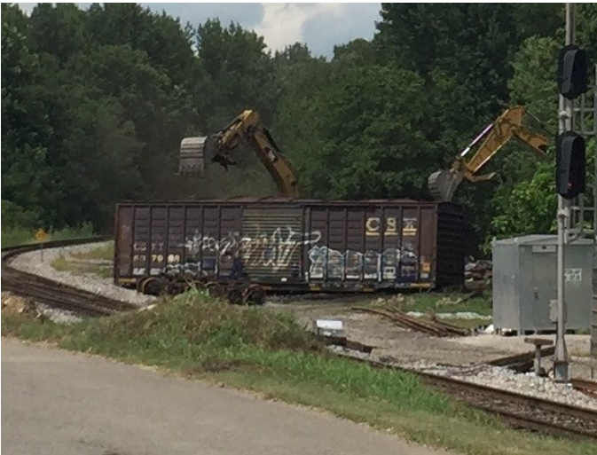
Above and below: The last CSX box car is "shredded" by two track hoes following the July 10, 2018 derailment in Mortons Gap KY.