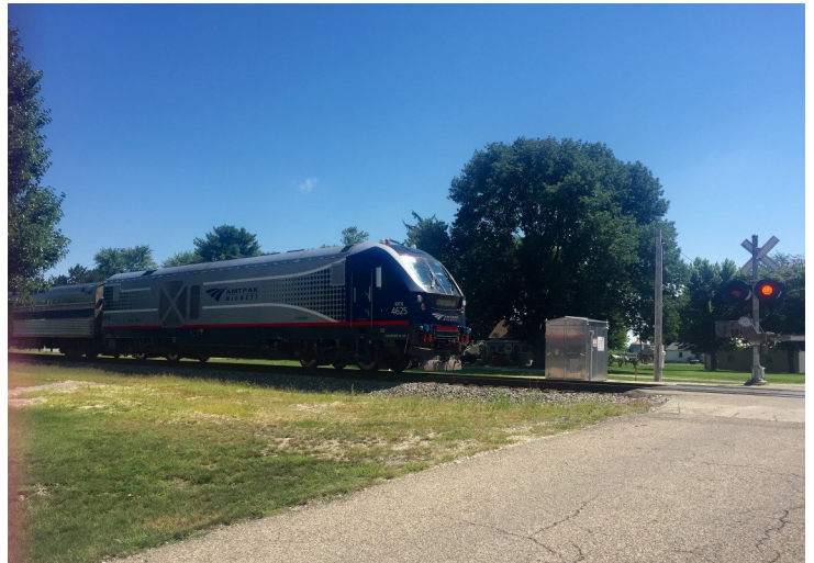
Above: Northbound Amtrak Saluki at Pesotum IL with a Siemens "Charger" locomotive in control. July 23, 2018.