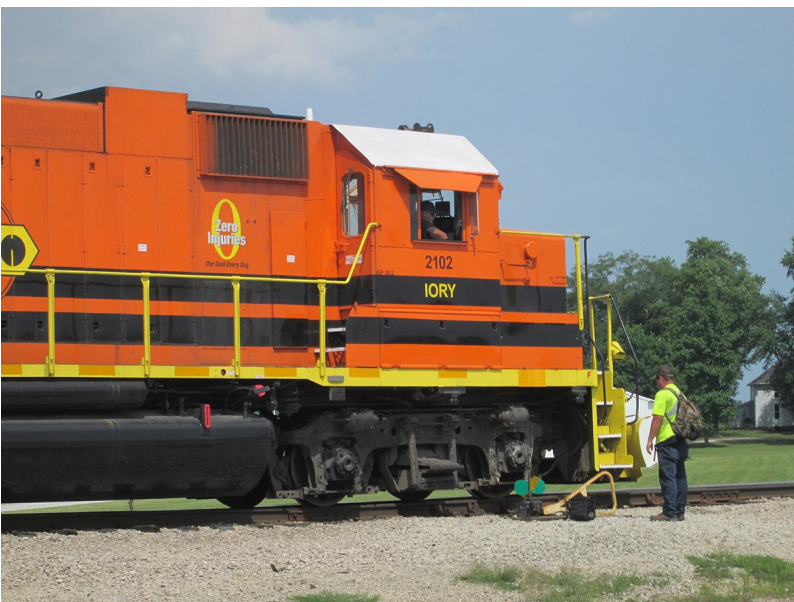
3rd Place, West Kentucky Chapter of the National Railway Historical Society photo contest. On July 5, 2018, the crew of Indiana & Ohio Railway's 2102, Local begins the day by switching cars in the small Konrad Yard at Washington Court House, Ohio, before heading out to switch customers at the industrial park south of town.