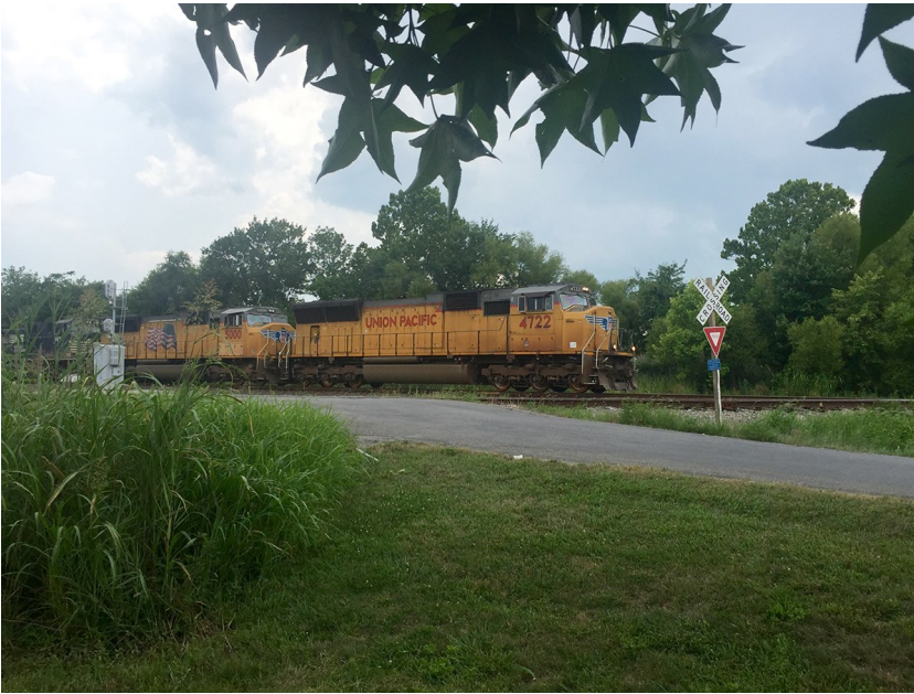
1st Place, West Kentucky Chapter of the National Railway Historical Society photo contest. Union Pacific 4722 leads a train northbound at the diamonds in Mount Vernon IL on July 14, 2018.