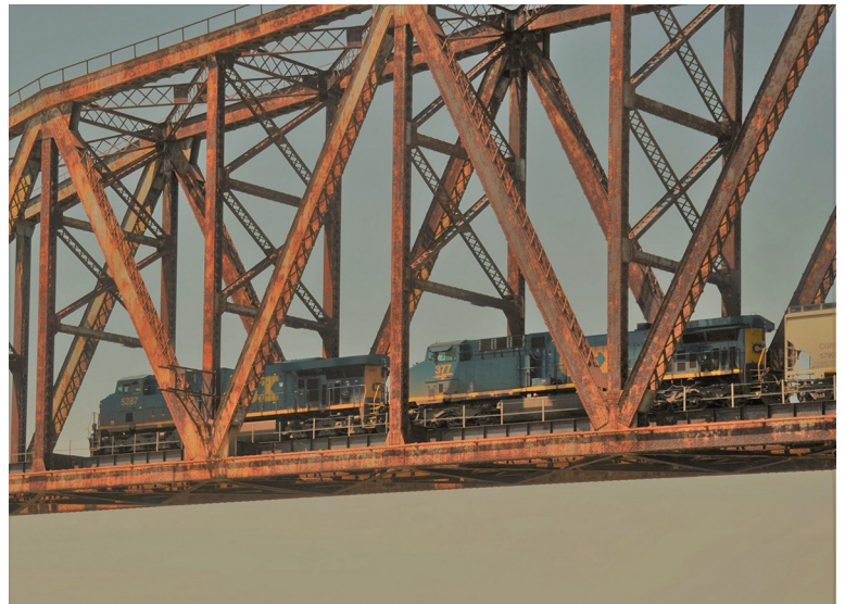
2nd Place, West Kentucky Chapter of the National Railway Historical Society photo contest. CSXT 5287 on the lead with 377 trailing, crosses the Ohio River from Henderson, KY to Evansville, IN as it makes its way north on the Henderson Subdivision.